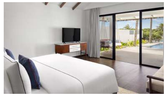
Ocean Beach Pool Villa