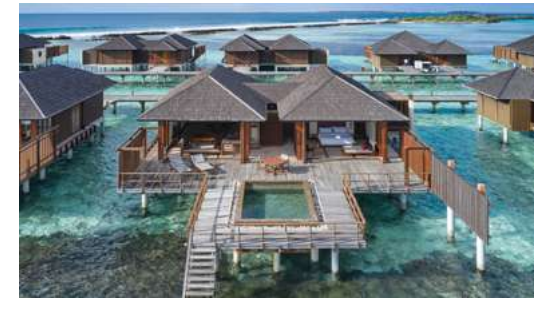
One-Bedroom Ocean Suite with Pool