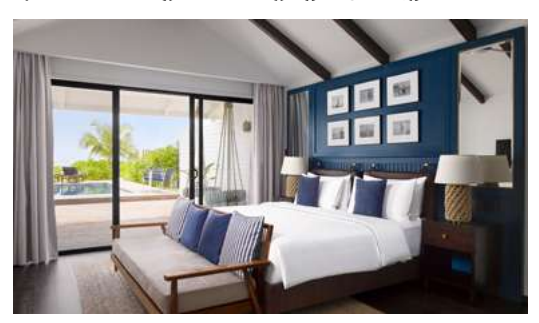
Deluxe Beach Pool Villa