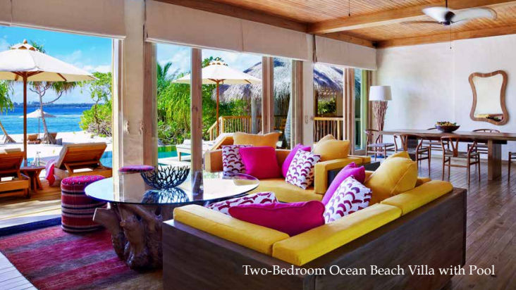
Two-Bedroom Ocean Beach Villa with Pool