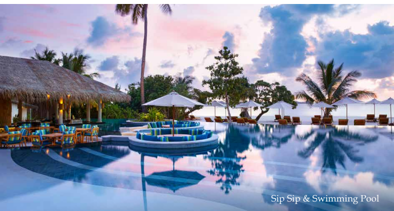
Sip Sip & Swimming Pool

Six Senses Spa offers nine private treatment nests, either with an ocean view or tucked away in the lush nature that surrounds them. Awaken the senses with locally inspired and Ayurvedic treatments, massages, yoga and fitness classes or workshops. Highly skilled Six Senses Spa therapists use a synergy of natural products to provide a comprehensive range of award-winning signature procedures and journeys, plus rejuvenation and wellness specialties of the region. Visiting practitioners offer guests lifestyle consultations and specialized holistic sessions.