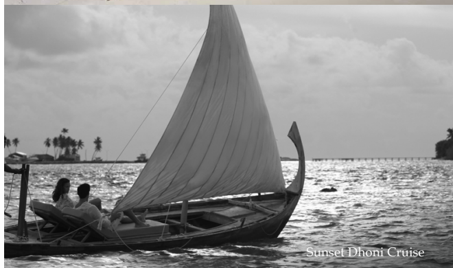
Sunset Dhoni Cruise