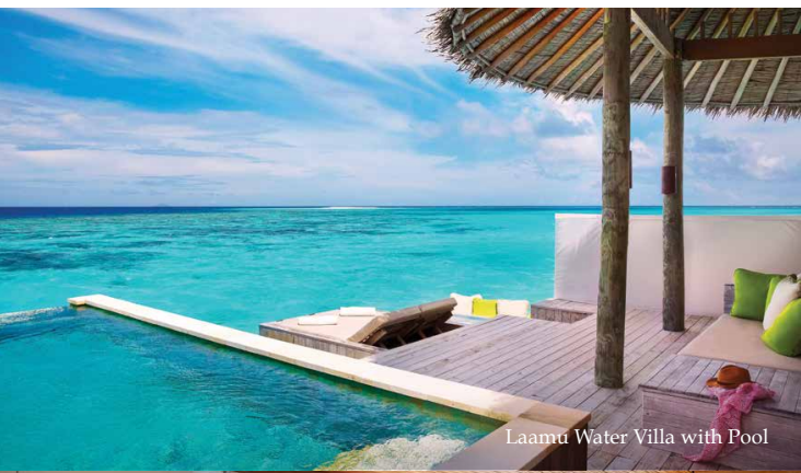
Laamu Water Villa with Pool